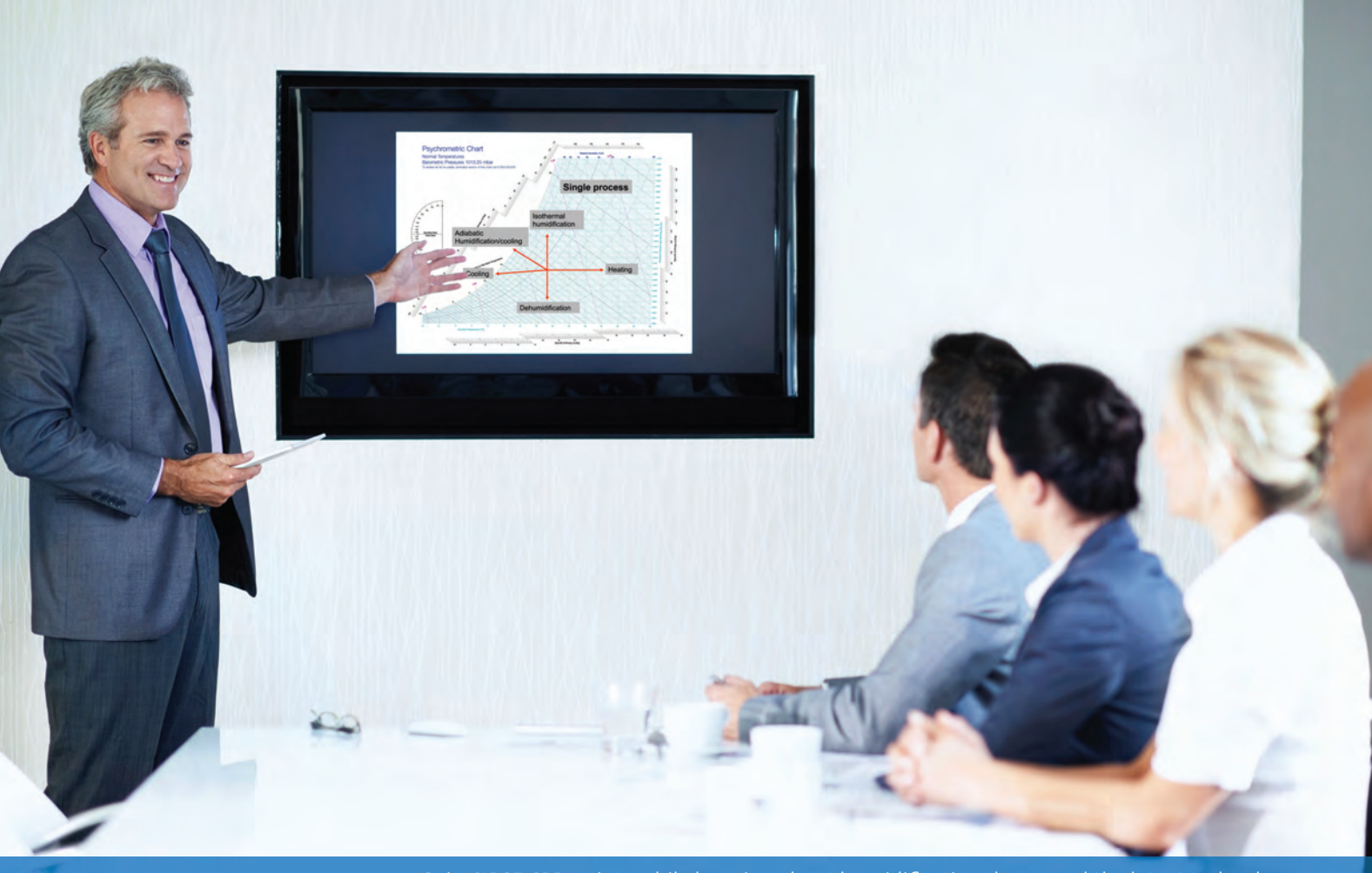
Gain CIBSE CPD points while learning about humidification theory and the latest technology